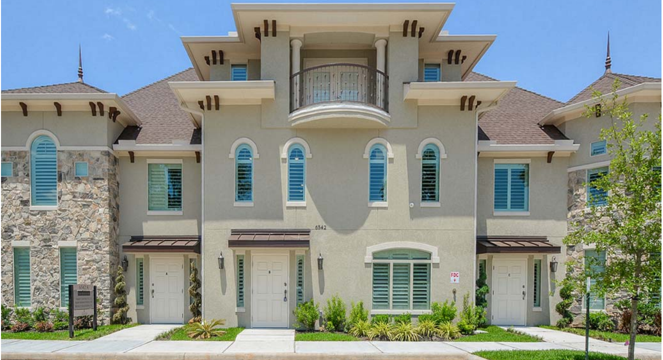
6542 Greatwood Parkway, Sugar Land, TX 77479

Perfect "Plug and Play" Office Condo located in the exclusive Greatwood Community in Sugar Land, TX. New and very contemporary 3 stories with amenities including, elevator, fully furnished offices, conference room, high speed cable-fiber and Voice over IP phone system. AV video technology. Breakroom, with refrigerator, microwave, and dishwasher. Convenient to 59 Freeway, professionally decorated with reception area, front and rear entrance. Lots of natural light.