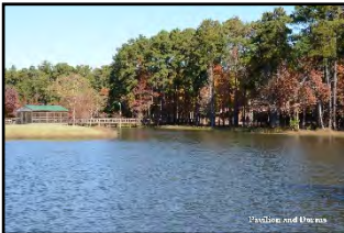
Decking and Office