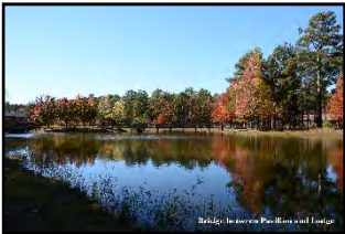
Bridge, Lecture Pavilion and Lodge

Equipped with a commercial kitchen, all you need is family, friends or co-workers to enjoy the serene outdoors. The surrounding area is a combination of residential, neighborhood commercial, agriculture and single family homes on large acreage. There are two dining areas with fireplaces and rocking chairs throughout the property for a relaxed environment. A three-bedroom, single-family residence with a screened porch, fireplace and lakeside view are amongst the 13 buildings on site. Beautiful Pine, Sweet Gum, Post Oak, Dogwood, Black Jack Oak and Cypress trees throughout.