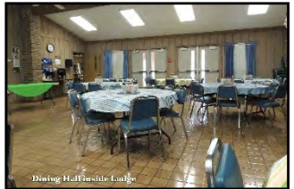
Dining Hall Inside Lodge