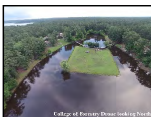
College of Forestry Drive looking North