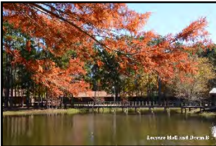
Lecture Hall and Dining B