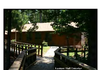
Lecture Hall Exterior