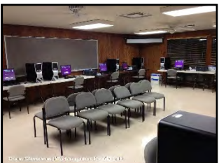
Class Presentation (ARVO Computer Lab) 4/24/13