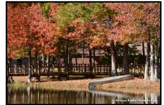
Arroyo Lake View of Lodge